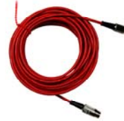
Photocell cable 001-30