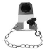
Mounting bracket BBG