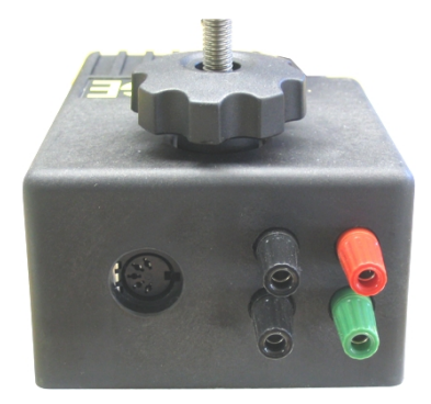
Startgate with two contacts