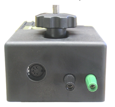
Startgate with one contact

You can chose between 6 different types of startgates STSn. Basically you can distinguish between manual or automatic startgates, quantity of the contacts as well as startgates with or without speech-amplifier.